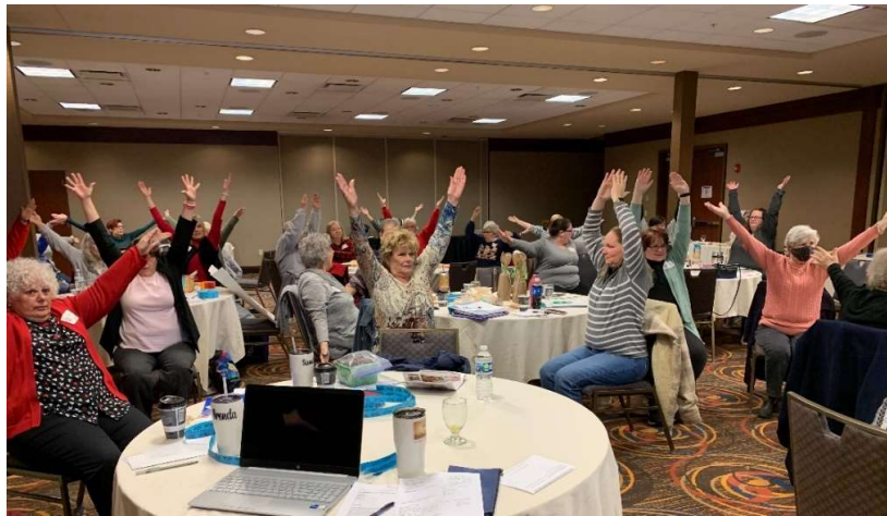
We did “Chair Yoga”